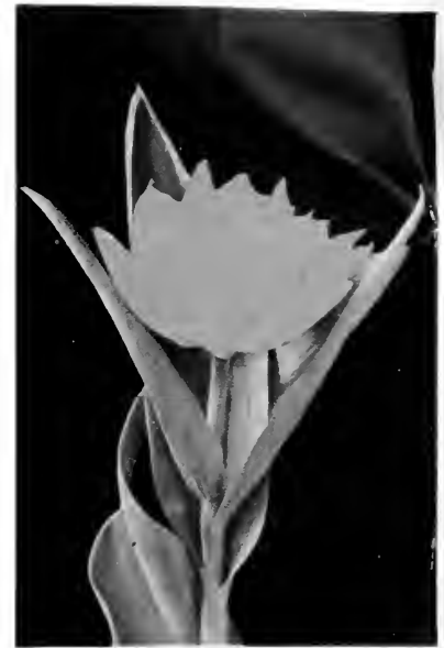
COURONNE D'OR Per doz., 90c; per 100, $7.20; per 1000, $64.00